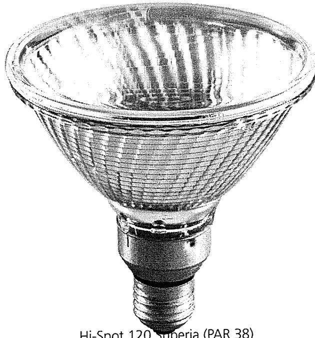
Hi-Spot 120 Superia (PAR 38)